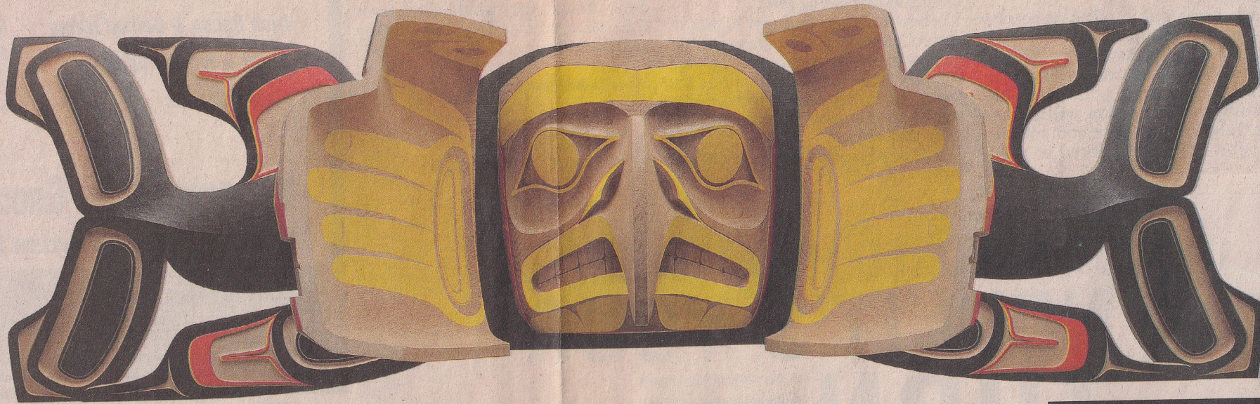
Killer Whale Transforming into a Thunderbird is a 2009 work by carver Robert Davidson (right).

In 1969, he carved a 12-metre Bear Mother pole, his first totem, and the first to be erected in Massett since the banning of the potlatch