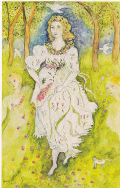
Homage to Botticelli , 2014, mixed media on paper 40" x 26"

Issue Price: $600 Released January 7, 2015