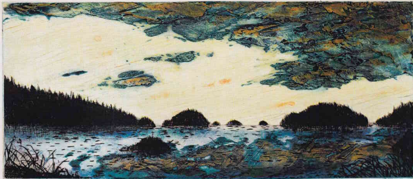
Nanoose, 2017 three-plate etching (2 copper, 1 plexiglass), ed. 60 image: 23" x 10" paper: 27" x 14"