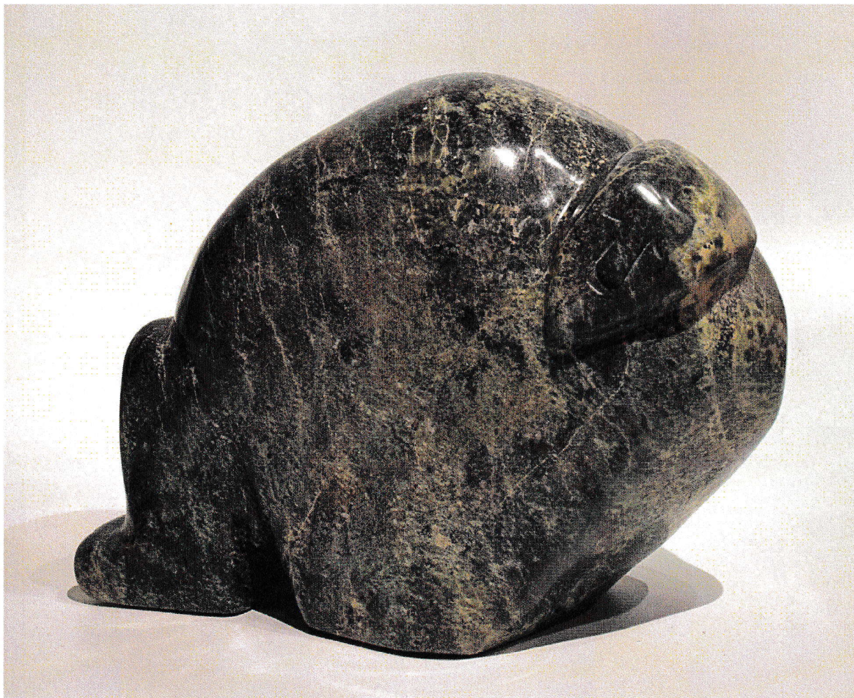
Shaman Spirit (c.1990)