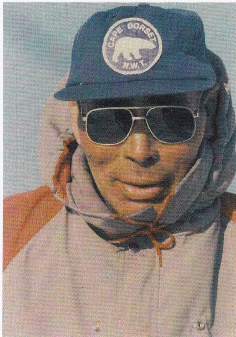
INUIT CAPE DORSET, NUNAVUT TERRITORY, CANADA 1928-1993