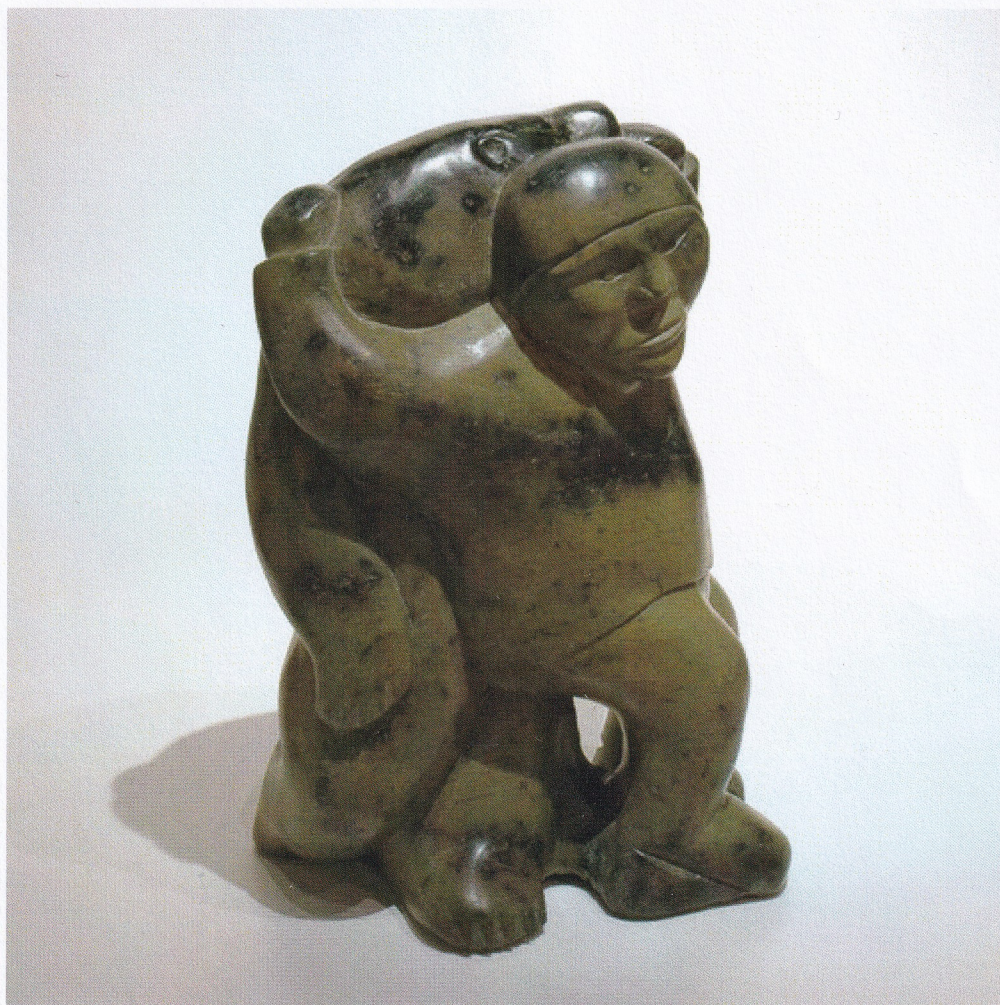
HUNTER WITH BEAR (C.1965-66)