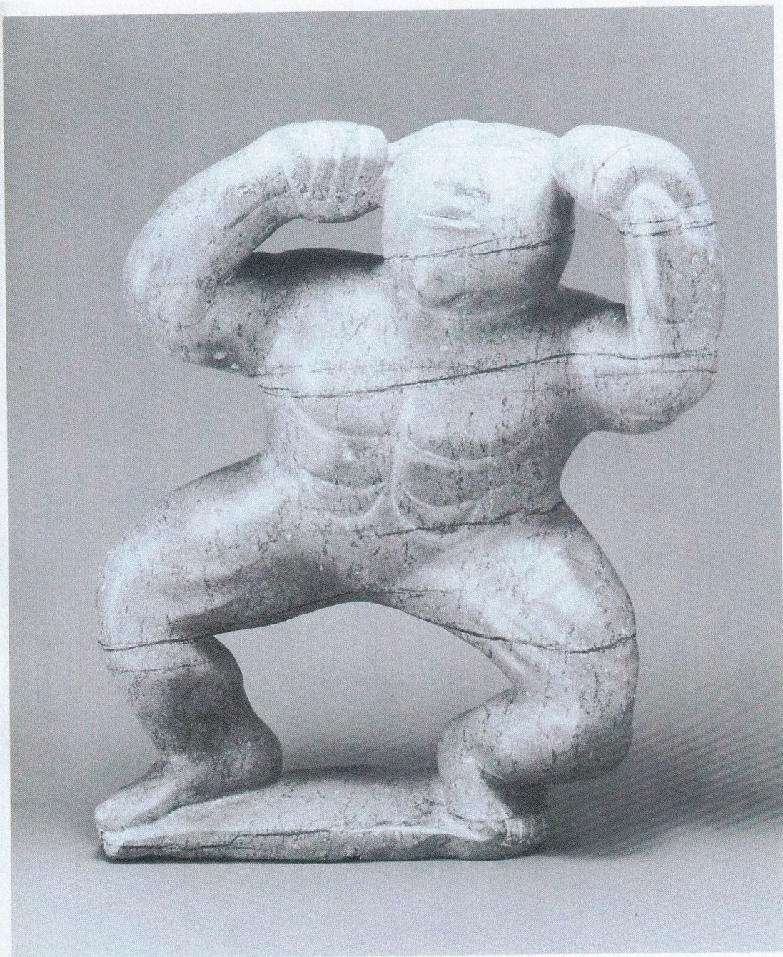
101. Qavaroak Tunnillie (1928- ) m. Dancing Figure Holding His Hair 1974 Green with black stone 42.5 x 37.3 x 19.5 cm Signed with syllabics and dated 78/430