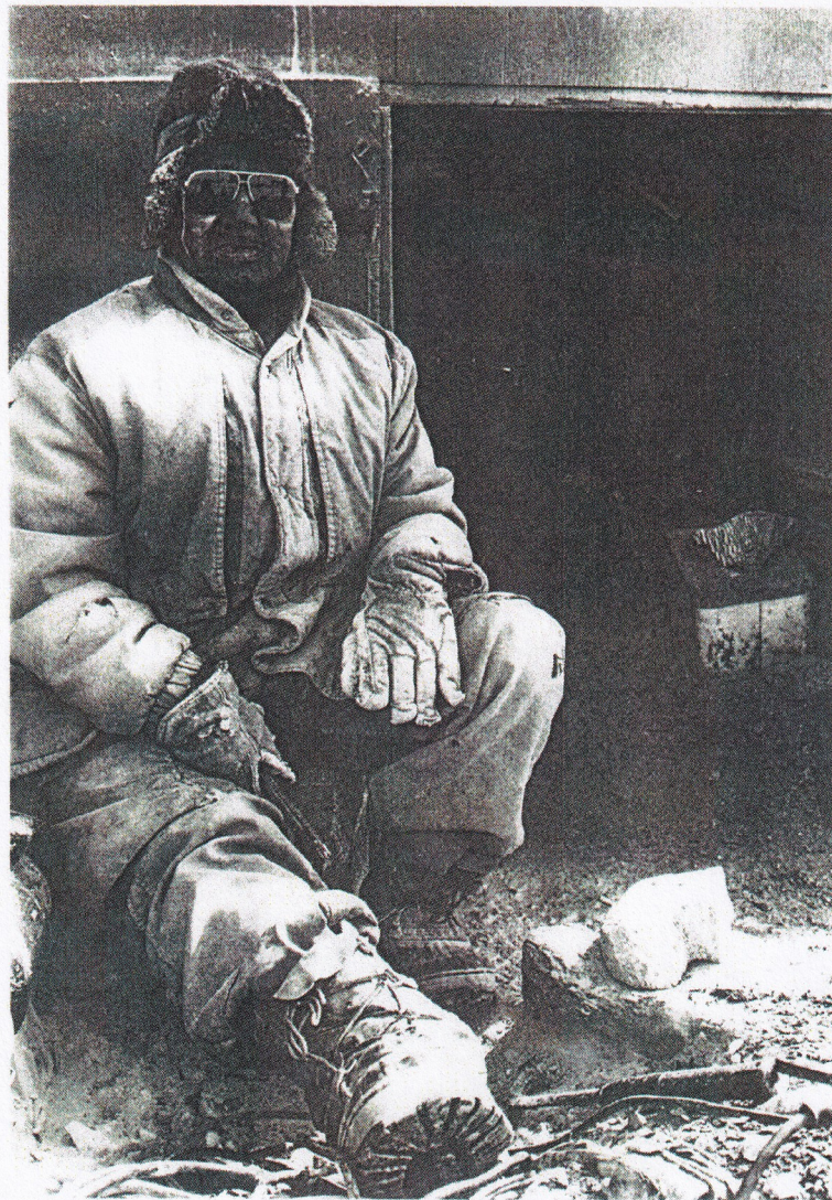
INUIT CARVER AT WORK