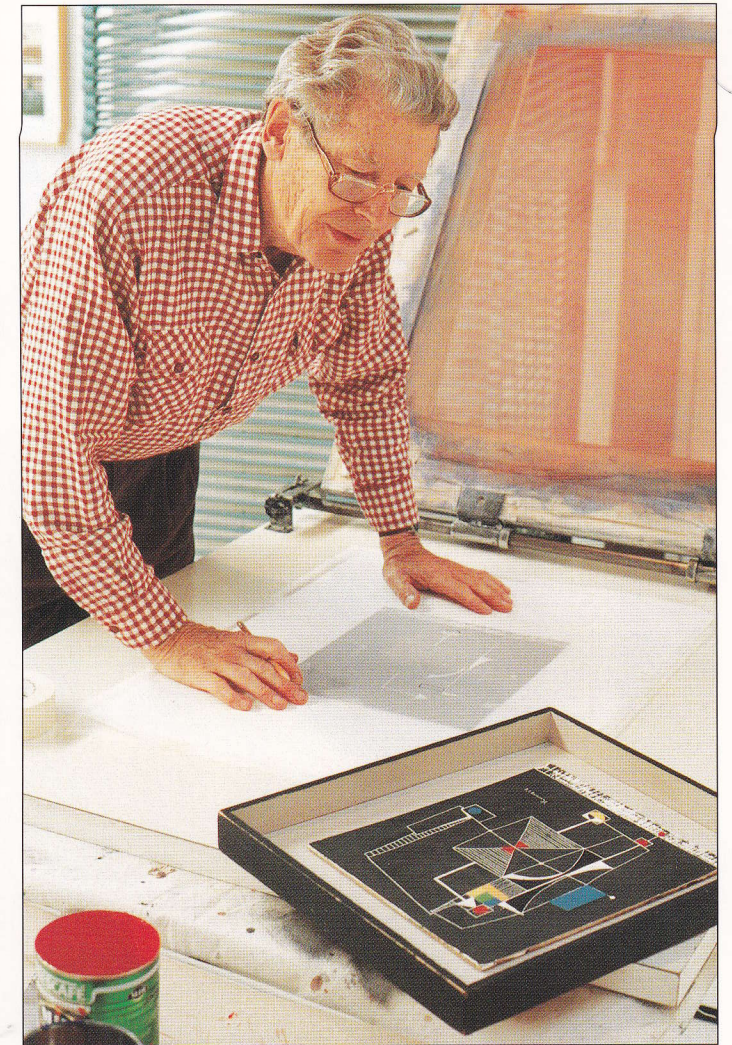
Gordon Smith carefully prepares a stencil for the Atomic Fountain print.